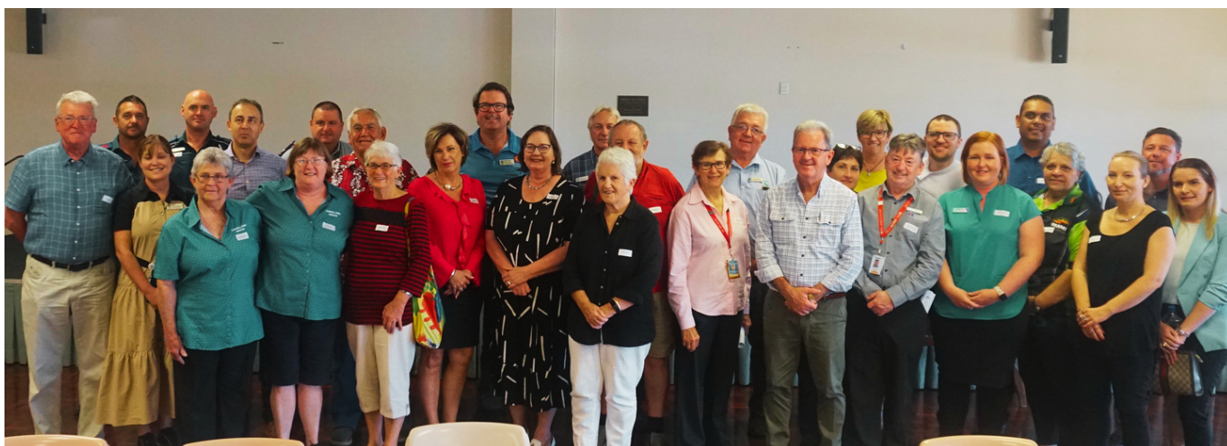
COLLABORATION: Stakeholders at the Health Stakeholder Forum in Cardwell