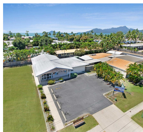
SUPPORT: Cardwell Family Practice